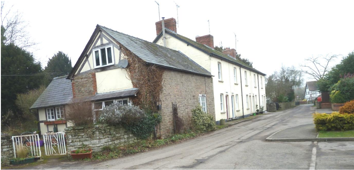
27 th January 2017.

Currently six cottages, but first recorded as only five. They are named: